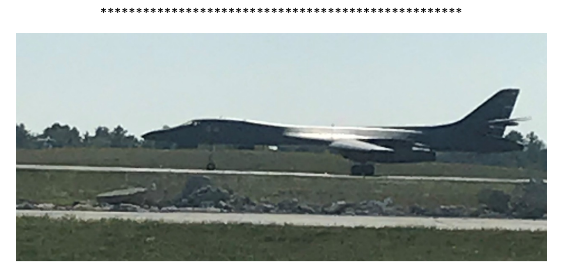
USAF B-1 bomber taxiing on the runway behind the MAM. Taken by Bob Littlefield, September 1, 2018

Next time you are in Bangor on a weekend, be sure to stop by and view the Normand O. Bureau Model Aircraft Collection. You'll be glad you did!