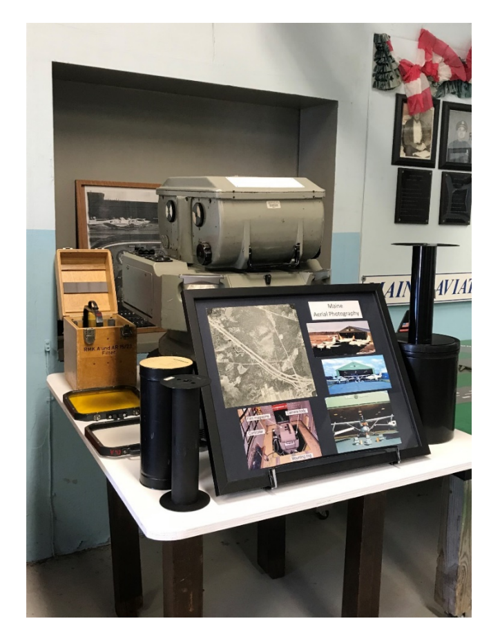
Aerial camera system displayed with accessories and a sample photo, taken by James Sewall Co., with this or similar equipment

This summer has been a busy one at the museum. Several new, exciting displays have been added thanks to donations by MAHS members and other generous Maine citizens. This edition of the Dirigo Flyer will introduce the new displays to you, and hopefully entice you to visit the museum to see the displays in person.